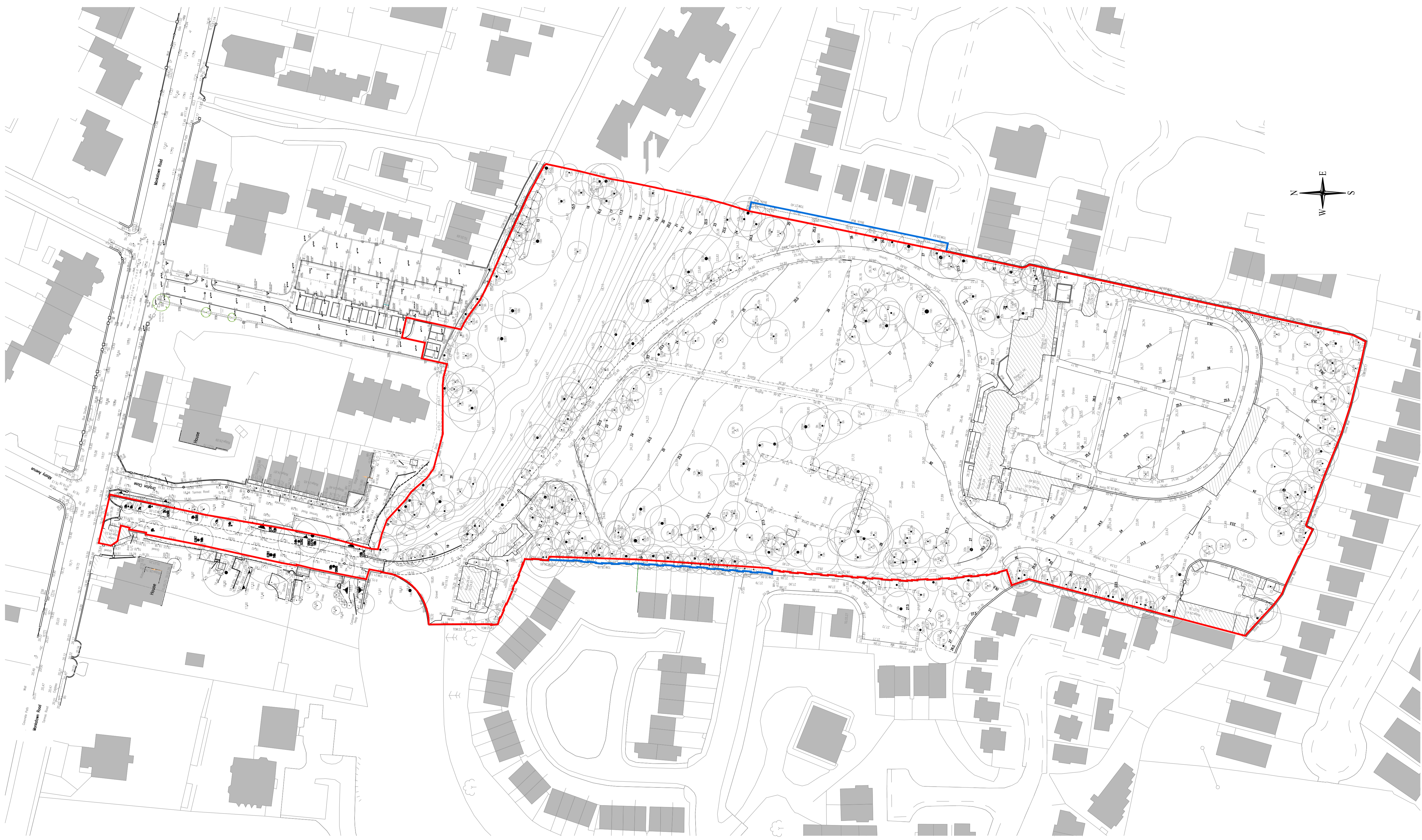
SITE PLAN SCALE: 1:750