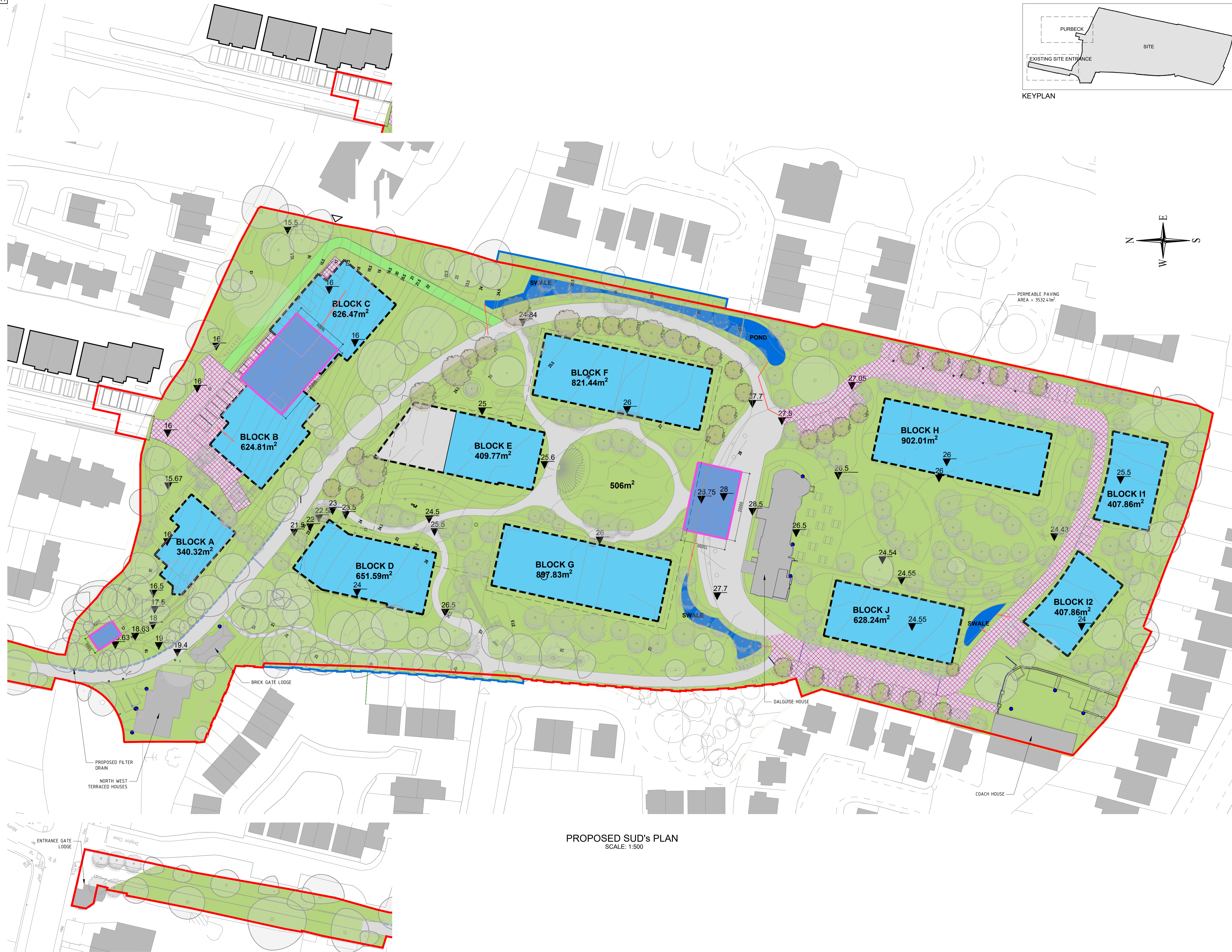
PROPOSED SUD's PLAN SCALE: 1:500